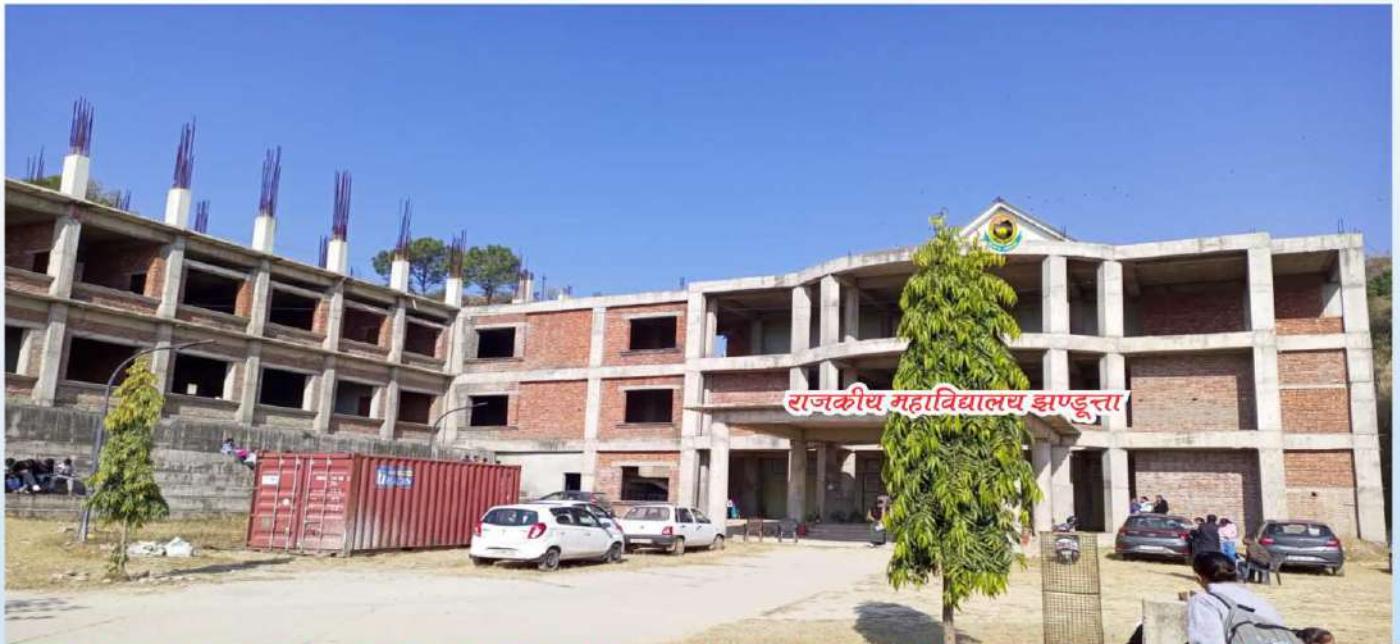
New Complex of Govt. College Jhandutta (Under Construction)

“ Use of Tobacco product and Alcohol is Prohibited in the College Campus ”