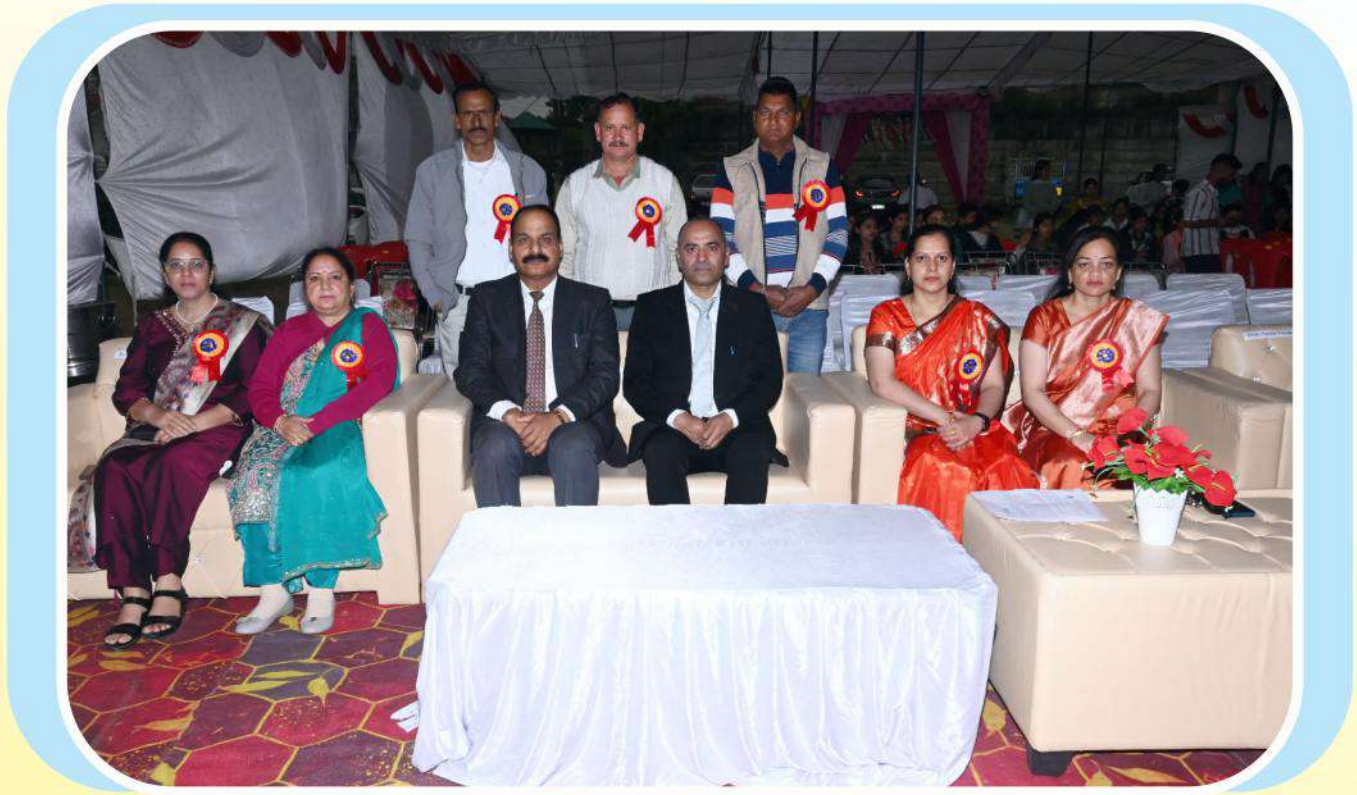
Non Teaching Staff