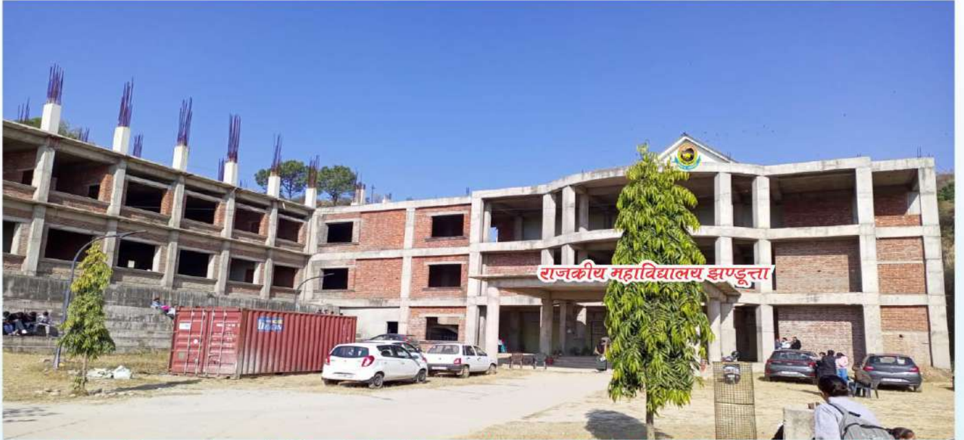
New Complex of Govt. College Jhandutta (Under Construction)

“ Use of Tobacco product and Alcohol is Prohibited in the College Campus ”